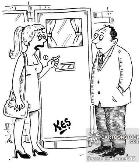
"I'd like to thank you for a wonderful date, but I've given up lying, for lent."