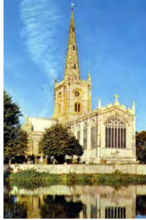
Holy Trinity Church, Stratford-upon-Avon