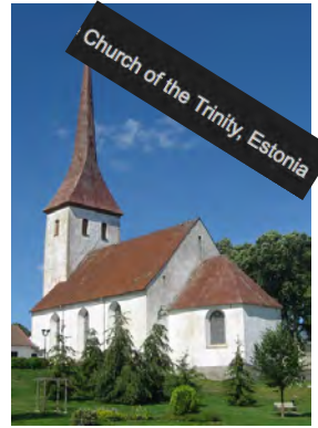
Church of the Trinity, Estonia