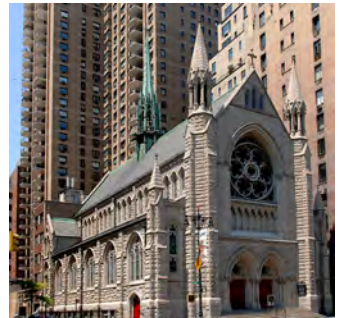
Lutheran Church of the Holy Trinity Church, New York City