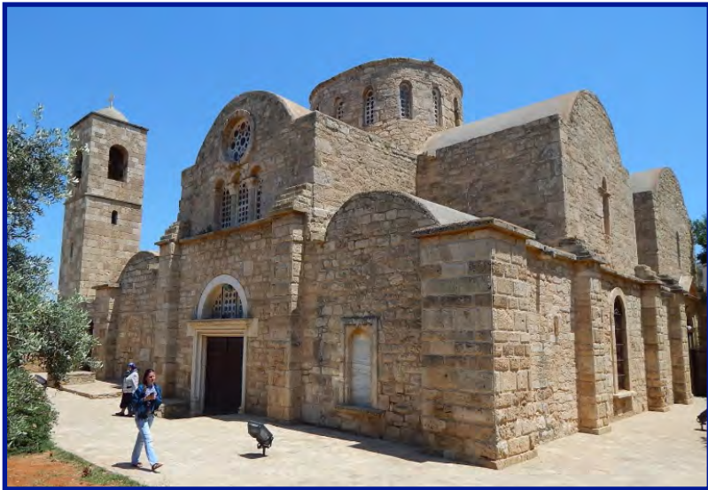
Monastery of St Barnabas near Salamis, Cyprus

To love God, to love each other and to love our neighbour