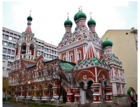
Church of the Trinity, Nikitniki Moscow