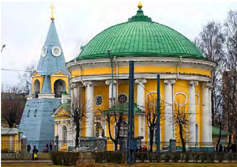
Church of the Blessed Trinity Saint Petersburg