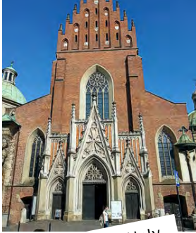
Holy Trinity Church, Krakow

We recently celebrated Trinity Sunday which made me think that almost every city has a Holy Trinity church. Here are some interesting ones.