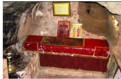
The Grave of St Barnabas

However, John Mark and some converted slaves from the local temple retrieved Barnabas' remains. They secretly buried them in a tomb beneath a carob tree to the west of Salamis, John Mark placing a copy of Mathew's Gospel on his cousin's chest. Hotly pursued by the Jews, who had discovered their plan, they escaped to Nicosia, where they managed to elude their pursuers and escaped to Egypt. The suppression of Christianity in Cyprus continued, and the tomb of St Barnabas was forgotten. By the