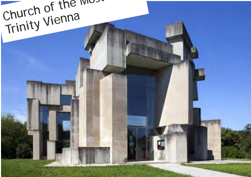
Church of the Most Holy Trinity Vienna