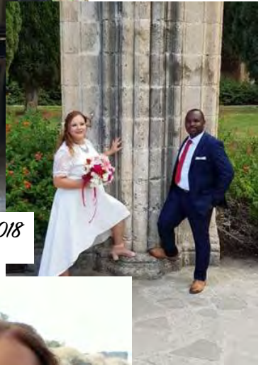
Sunday 26 August 2018