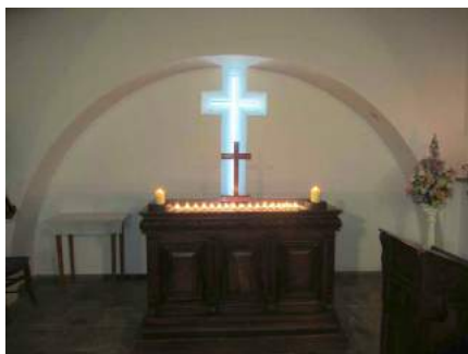
Candles for lost loved ones

You can keep in contact from overseas by becoming a member of the Friends of St Andrew's . It costs £30 per annum and the magazine will be posted to you. To subscribe, please contact us by post: PO Box 171, Girne, Mersin 10, Turkey or email at office@standrewskyrenia.org