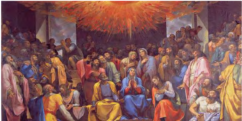
What is happening? Are we to be taken up in a whirlwind, as Elijah was? Will we go now to be with our Lord, wherever he is?

On the Feast of Pentecost, while we prayed together, the room suddenly filled with wind that seemed to come from an ocean or a desert. Or a cave or mountain. It was fresh and cool yet weighted with unnameable fragrance and crackling like fire. The two small windows and the seemingly calm weather outside could not account for this roaring, invisible, electric rush of air.