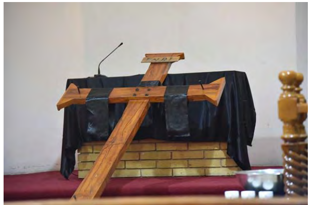
The cross lies on the Altar

The congregation at St George Baghdad kept Good Friday with great devotion. After hearing the Passion according to St John and the Solemn Intercessions, all venerated the cross set up in the sanctuary by kneeling or bowing before it.