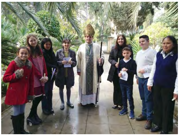
Confirmations at St Paul, Nicosia

Eight candidates of widely varying backgrounds were confirmed on the Feast of the Epiphany at St Paul's Cathedral, Nicosia.