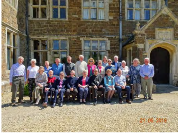
Friends meeting at Launde Abbey - May