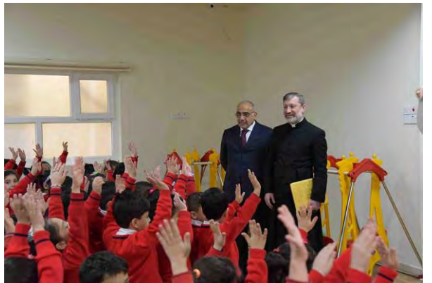
Meeting with the school children