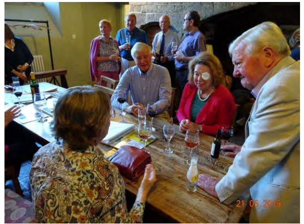
Friends gather for fellowship and chatter

It was good to be with people who a have a real interest in the diocese as well as a good understanding of what the diocese is about.