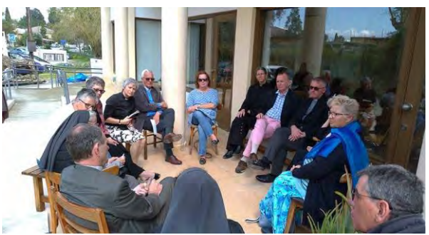
Outreach Forum Meeting