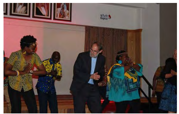
The Kenyan community led the dancing