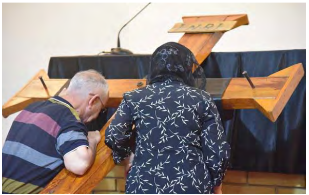
Others pray at the cross

Approaching, they had sipped a drink made specially to commemorate the vinegar offered to Christ