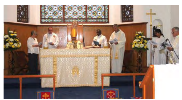
The service continues