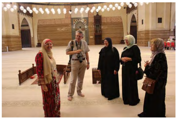
A visit to a Mosque

The Sunday evening Eucharist occurs after work and appeals to those who enjoy a lie-in on their day off. This week it was followed by Living-Room Dialogues in the Deanery. We enjoyed a 'bring and share' supper then were treated to a talk on sustainable energy. Basic information was given; including about the different types of light bulbs. Expats, on the whole, live in rented accommodation so the range of energy-saving measures that are available to owner occupiers are not available to many in Gulf countries. Another suggestion was that 24° was cool enough for air conditioning systems. When I changed the temperature setting of the air conditioning unit in the Bishop's flat from 23° to 24°, I no longer needed to wear a cardigan.