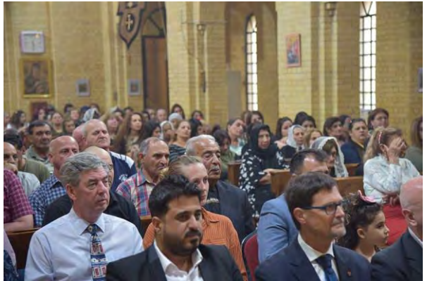
Many people attended the service

Alleluia, Christ is risen. He is risen indeed, alleluia. Al Masiah qam. Qam, qam, qam.