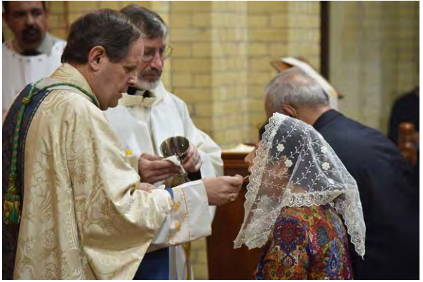
Easter Sunday communion

The Great Three Days culminated in the final Paschal Eucharist on Sunday. The people of St George Baghdad were joined by ten staff from the British embassy, and the resurrection of Christ was celebrated with much singing and plenty of incense.