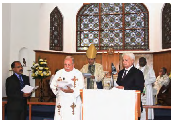
New Dean in Bahrain - June