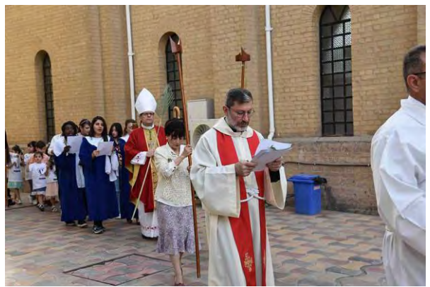
Palm Sunday Procession in Baghdad - April