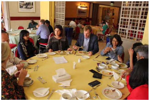
A celebratory meal with the confirmees