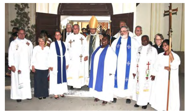
Group photograph following the service