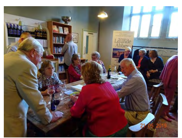
Another view of fun at the Abbey

It is a wonderful few days together and I strongly encourage you to put the dates in your diary and come along if you possibly can.