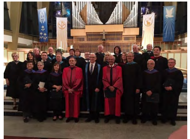
Queens College Newfoundland