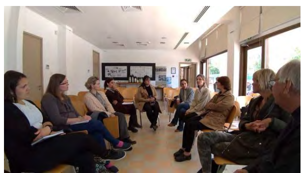
A small-group meeting

Some NGOs expressed a sense of compassion fatigue, due to the challenges they face in attempting to change opinions and ensure conditions of dignity for those they work alongside.