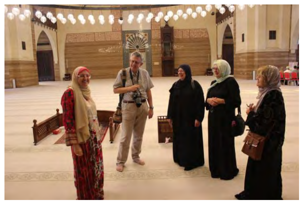
Christians Aware Group visit a Mosque