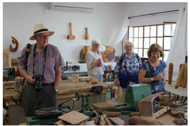
A visit to a Craft Centre

A drive around the island allowed us to spot the first oil well, which produced oil from 1932. as well as a number of prehistoric burial mounds of the Dilmun civilization. We drove round a Shi'a area, where social housing was being built. The house sizes looked quite substantial There is a disparity in wealth to me. between the Sunni and the Shi'a population. We made a brief visit to a camel farm. A visit the Craft Centre around the corner from the Cathedral enabled us to meet Bahraini people working and displaying their wares.