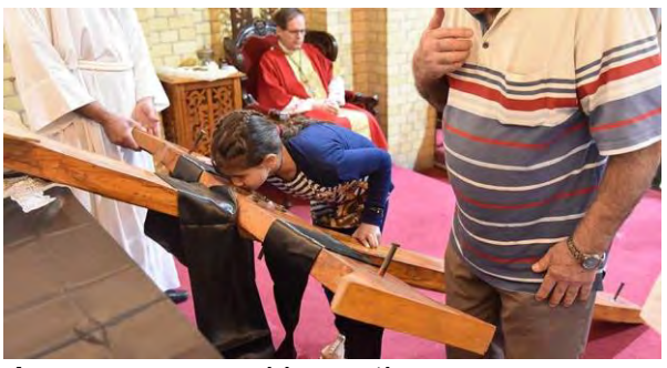
A young person kisses the cross

The congregation at St George Baghdad kept Good Friday with great devotion. After hearing the Passion according to St John and the Solemn Intercessions, all venerated the cross set up in the sanctuary by kneeling or bowing before it.