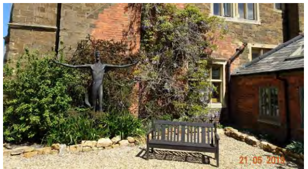
Launde Abbey is a blessed retreat

It is a wonderful few days together and I strongly encourage you to put the dates in your diary and come along if you possibly can.