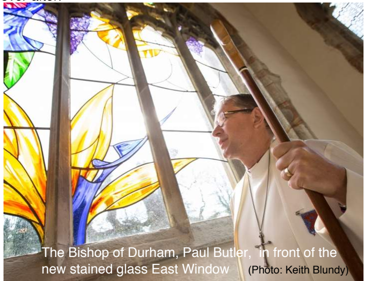
The Bishop of Durham, Paul Butler, in front of the new stained glass East Window