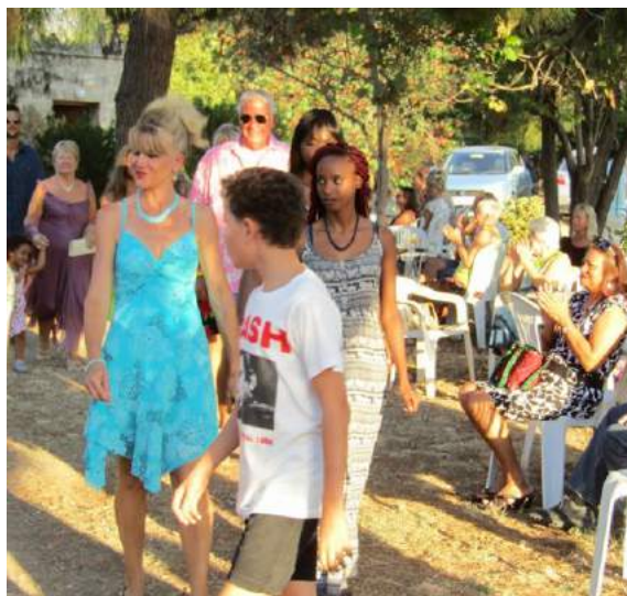
Some of the lovely Fashion Show models